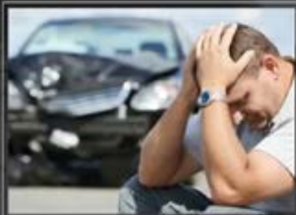
AUTO INJURY CARE