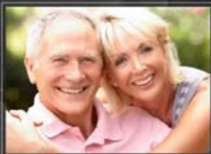
OPIOID-FREE PAIN MANAGEMENT